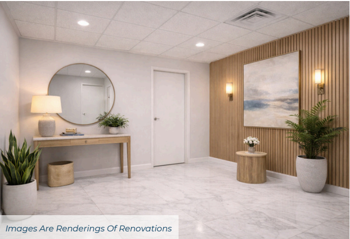
Images Are Renderings Of Renovations