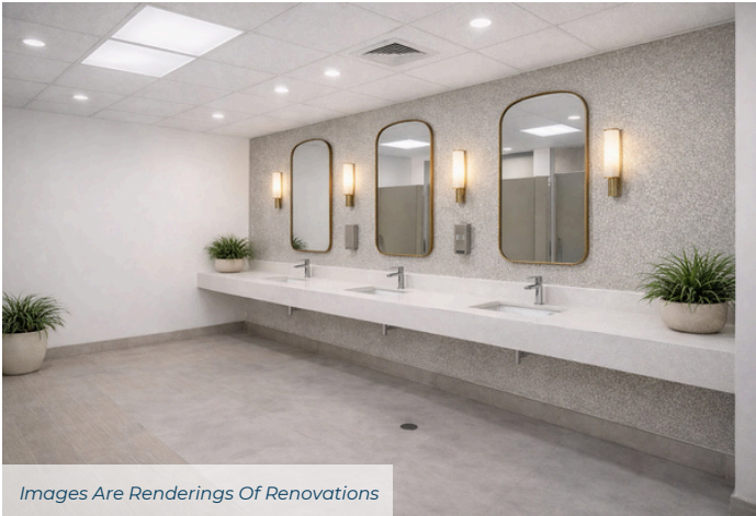
Images Are Renderings Of Renovations