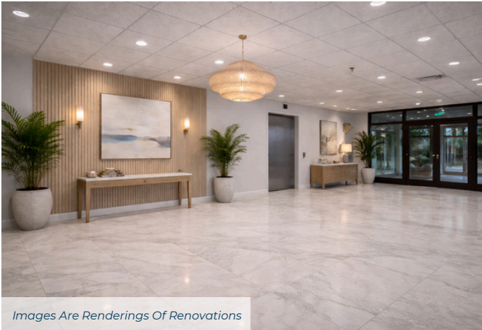
Images Are Renderings Of Renovations