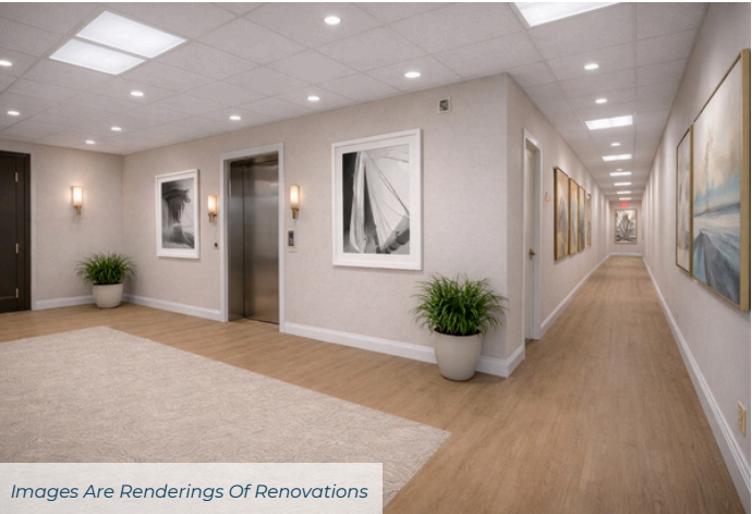
Images Are Renderings Of Renovations